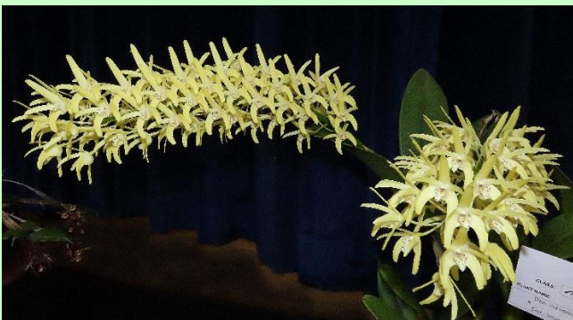
Champion Dendrobium Species

Den. speciosum var. curvicaule 'Blew Moon' x 'Herbmere'