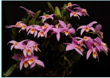
Cultural Plant of the Month

Here are those chosen at our September 2023 meeting.