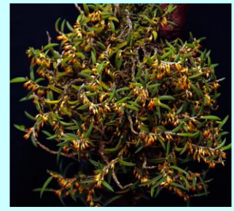
Plant of Interest