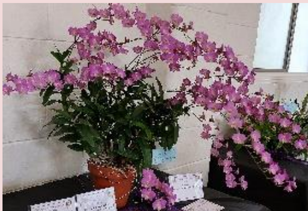
Reserve Champion Orchid Champion Australian Native Orchid and Champion Specimen Orchid Den. Fantasy Land 'Sweetie'