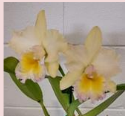
Champion Novice Rlc. Aussie Sunray 'TNT' (left)

On 31 st August, we held a bus trip to Mt Tamborine visiting the Knoll National Park (morning tea), Windemere Farm gate and Fame Orchids. An excellent lunch was had at the Spice of Life café before visiting the shops on Gallery Walk. The trip was well supported by our members and visitors, and we hope to organise another soon.