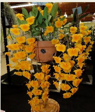
Den. lindleyi var. majus