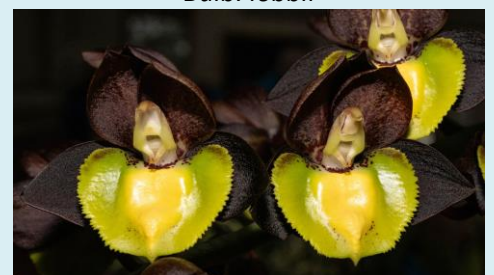
Ctsm. Pileabrosum Green

Pine Rivers appreciates the help given by our regular judges. We also value the help given by all our members as they volunteer in various roles to help our Society prosper! We aim to provide a welcoming community group where friendship and learning are fostered.