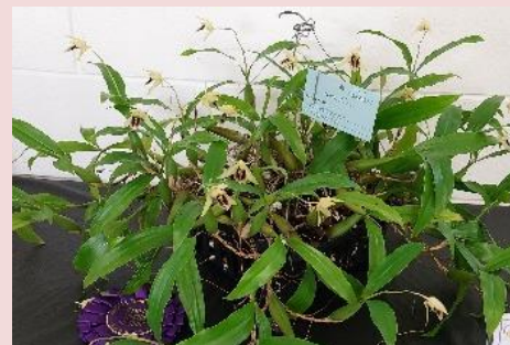
Champion Species Orchid Coel. ovalis

Benching numbers improved on last year with the Cattleya Alliance classes well represented.