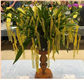
Champion of Show

This year North Brisbane Orchid Society has again held an Annual Orchid Show at Mt Coot-tha Gardens Auditorium in late August. Public interest in these events seems to be continuing and attendances are always good. Plant sales are well patronised as orchids are seen as lovely gifts, or the shows are a great place to purchase plants for home and help is always available with cultural information on how to care for your new orchid plant. Our Champion orchids are shown below