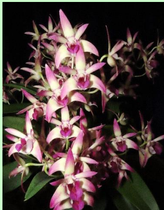
Champion Hybrid Specimen