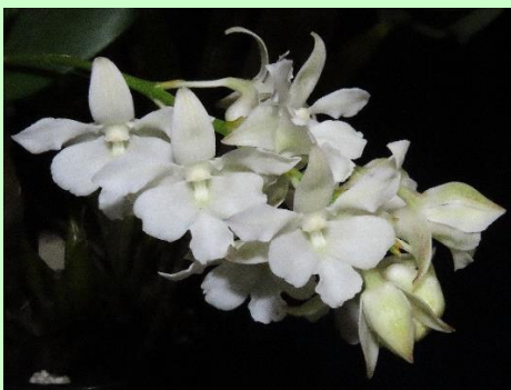
Champion Any Other Hybrid