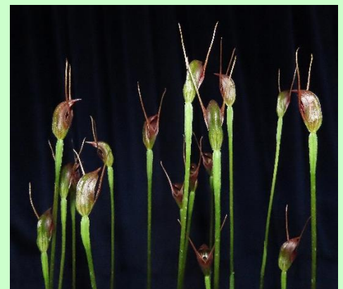
Champion Any Other Species