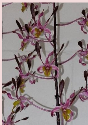
Champion Orchid of Show

On Saturday May 12 th , we held our May Show at Wavell Heights Community Hall. It exceeded our expectations with 361 visitors through the door. Queues for plant sales began early with the new layout in the upper hall being well received. Floral art sales remained brisk throughout (Mothers' Day weekend bonus for us!)