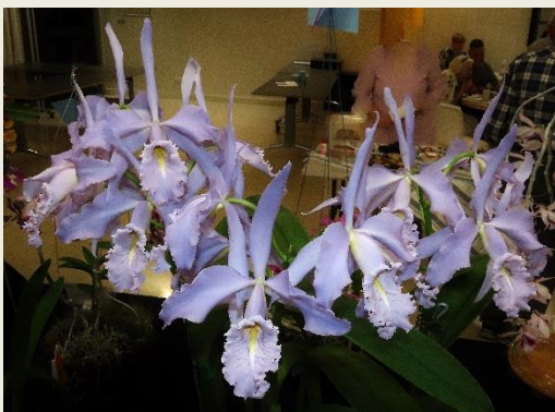
C. maxima h.f. coerulea