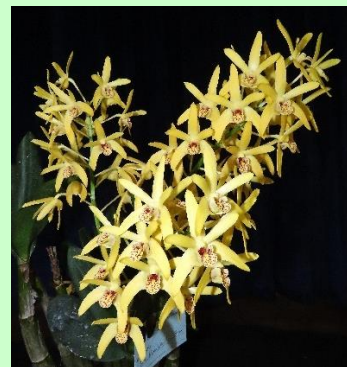
Champion Dendrobium Hybrid

Den. speciosum var. curvicaule 'Blew Moon' x 'Herbmere'